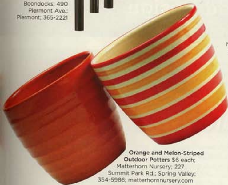
Orange and Melon-Striped Outdoor Potters $6 each; Matterhorn Nursery; 227 Summit Park Rd.; Spring Valley; 354-5986; matterhornnursery.com