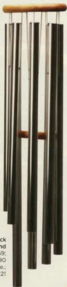
Woodstock Gregorian Wind Chimes $59; Boondocks; 490 Piermont Ave.; Piermont; 365-2221

You don't need the lushest landscape or perfect shrubs to make your backyard the envy of the neighborhood. You only require a few well thought-out decorating touches: Colorful potters, a rustic lantern, and a melodious wind chime can help set a relaxing scene at home. Who knows? You just may be glad you planned that stay-cation, after all.