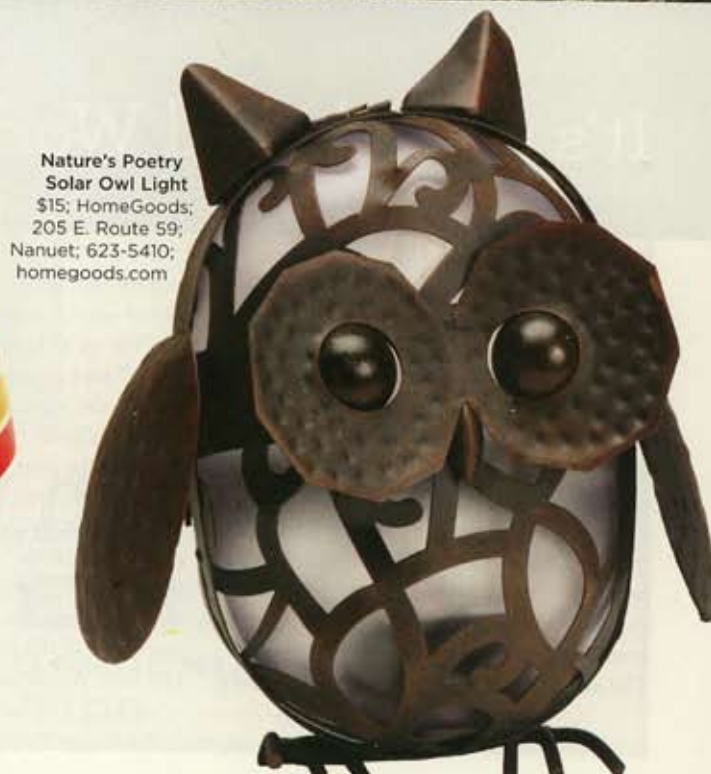
Nature's Poetry Solar Owl Light $15; HomeGoods; 205 E. Route 59; Nanuet; 623-5410; homegoods.com