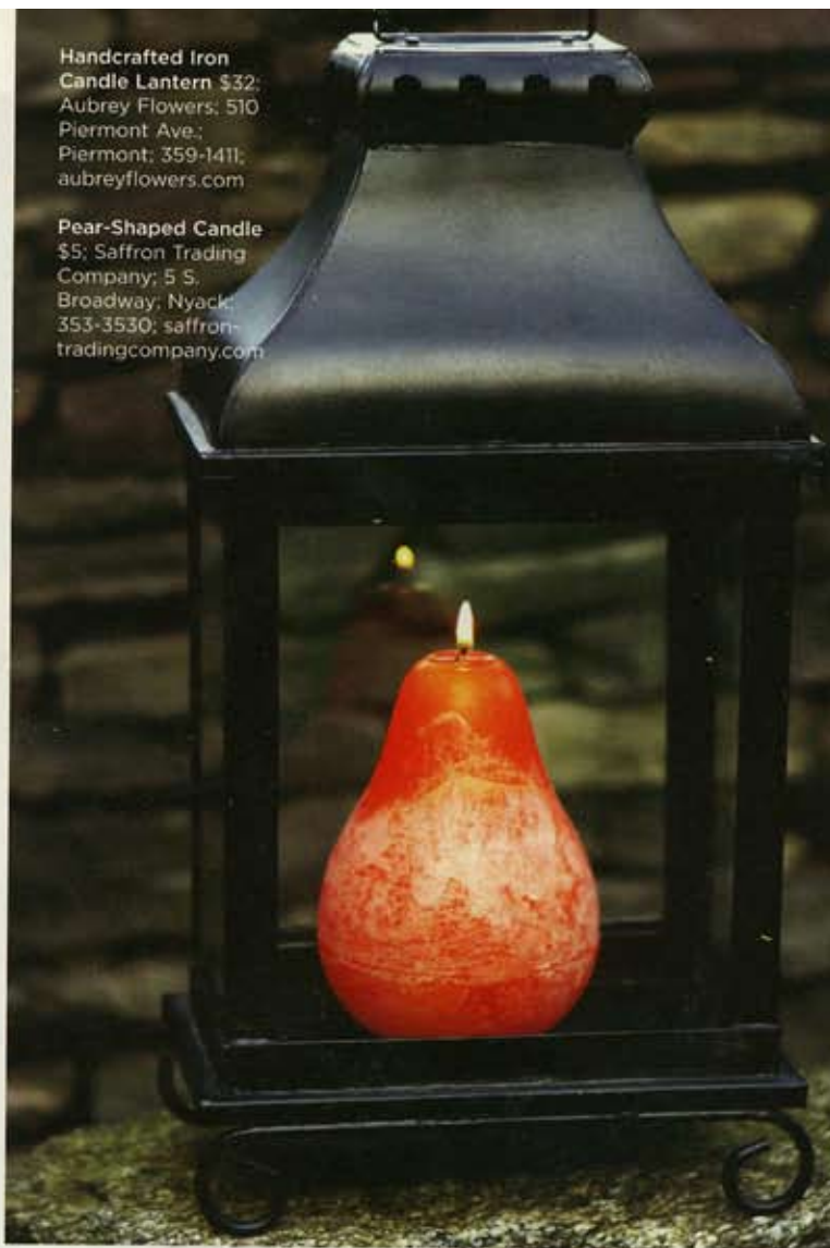
Handcrafted Iron Candle Lantern $32; Aubrey Flowers; 510 Piermont Ave.; Piermont; 359-1411; aubreyflowers.com